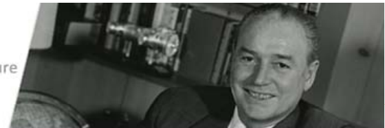
Exhibit Opening May 1, 2012

VIRTUAL EXHIBIT » THE COLLECTION » EDUCATION » EVENTS » ABOUT »