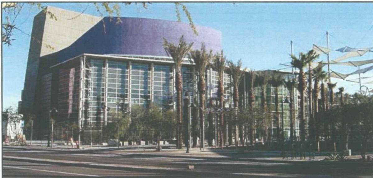
Mesa Arts Center One East Main Street, Mesa, AZ 85201

The art galleries will be open for viewing during the reception.