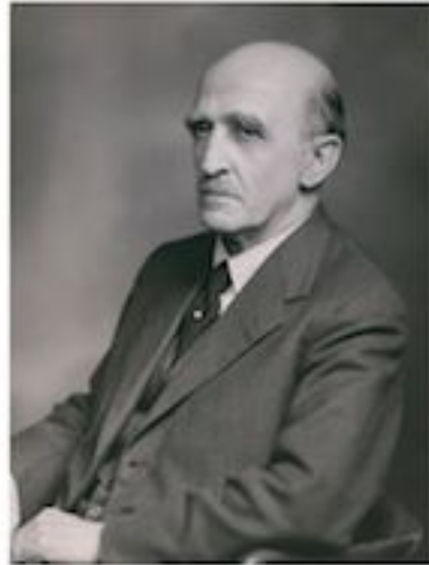
Sir (Charles) Hilary Jenkinson