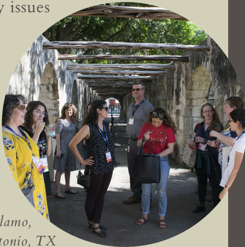
Reception at The Alamo, SSA 2018, San Antonio, TX